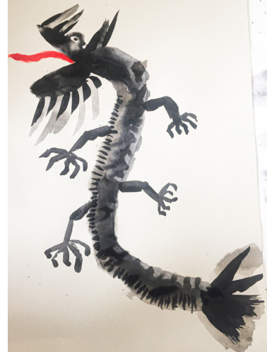
Year 6 Traditional Chinese Painting