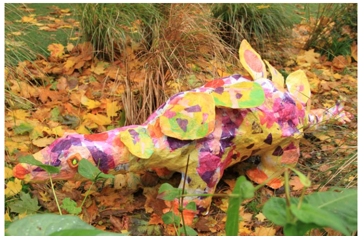
'super-mega diplodocus, Spotty the Dinosaur',