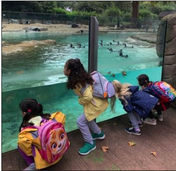
More Year 2 at the zoo!