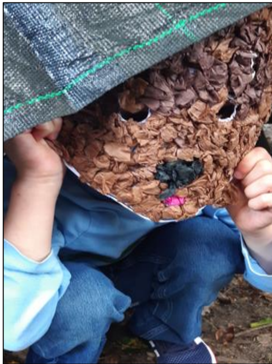
Found him, at last.